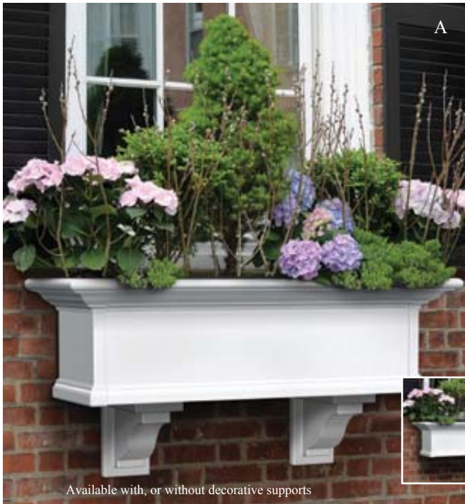
Available with, or without decorative supports

Enhance the look of your home with Mayne's beautiful collection of window boxes