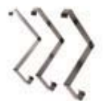
Optional deck rail brackets for use with Fairfield window boxes and designed for 2x6 railings