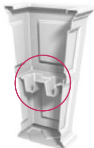
Sub-irrigation water system and removable tray insert