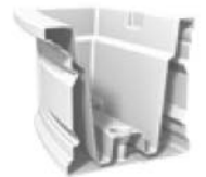
Sub-irrigation water system