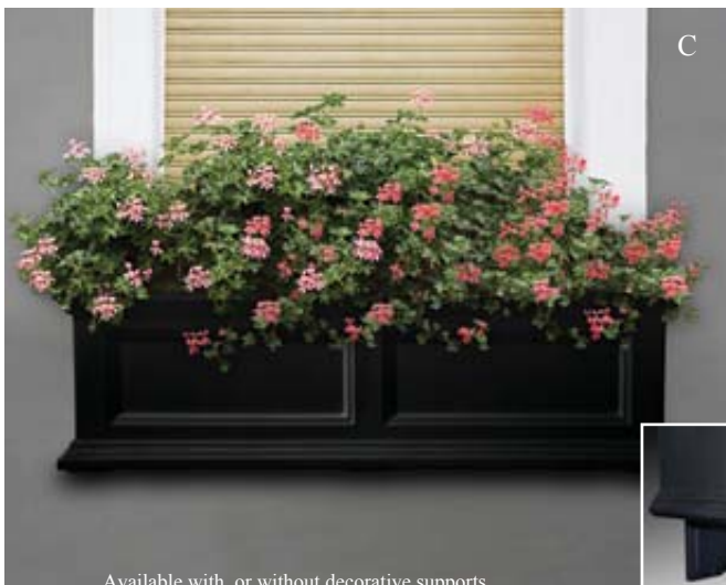
Available with, or without decorative supports

Mayne products are made from either durable, high-grade polyethylene or vinyl, both of which are beautiful and maintenance free. You'll have years of enjoyment with no need for painting or staining.