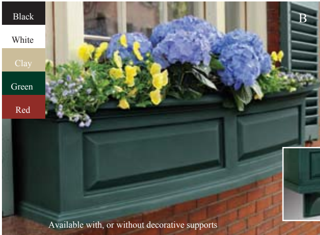
Available with, or without decorative supports