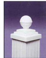
6" Column Clad Post Cap with 4x4 Ball Cap