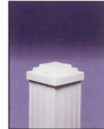
6" Column Clad Post Cap