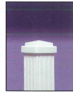
4" Column Clad Post Cap