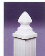
6" Column Clad Post Cap with 4x4 Gothic Cap