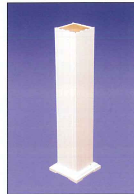
Fluted Column Cladding